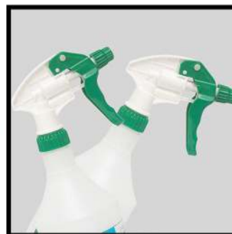
Replace trigger and shake gently to dissolve sachet