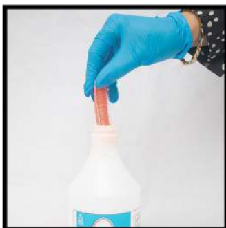
Add 1 liquid sachet to bottle

Dilution Ratio 1 Sachet per 750ml Trigger spray bottle.