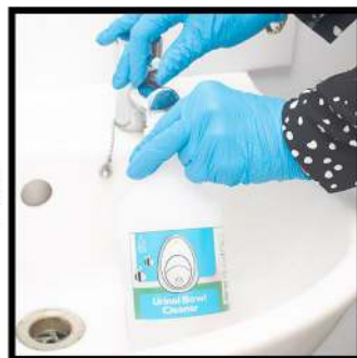
Fill bottle with water to 750ml level