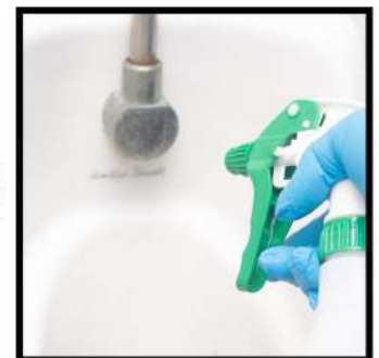
Spray directly to all washable surfaces and wipe with cloth